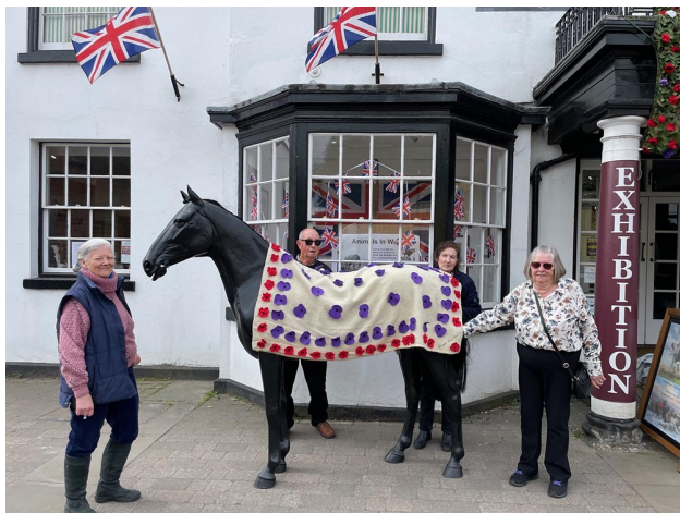
photo of the rug on the horse, inspired by the horses who went from Ossington Estate in WWII.

The Museum of the Horse auction was a great success, selling to Denmark, Ireland, Switzerland, Spain, Germany, USA and Ireland. It is amazing what can be done over the internet these days.