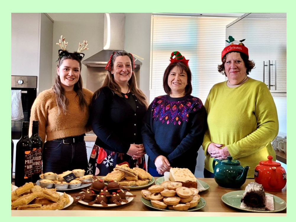
The Community Coffee Morning in December